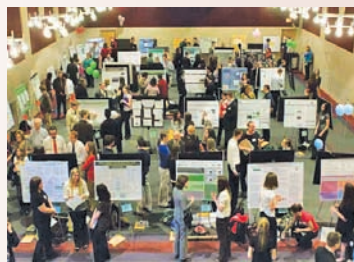
An aerial view of one of the poster rooms during UURAF.

Nearly all of the students at the School's Research Fair also participated in UURAF (see *d names in the article inset above).