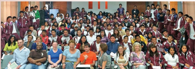
High school auditorium