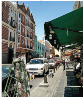
City market on the streets of Puebla