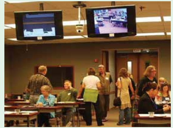
Classroom in Marquette with East Lansing visible on the monitors at 20th anniversary of first Marquette program.