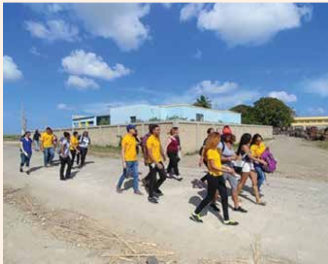
One team of MSU students and UCE medical students (yellow shirts) together, walking from the bus into the town to do community work.

The students' in-country experience was bookended by cultural day trips for exposure to the history, food, living, and culture in Santo Domingo and San Pedro.